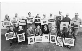
BCC Exhibition in the Michael Heseltine Gallery 2010